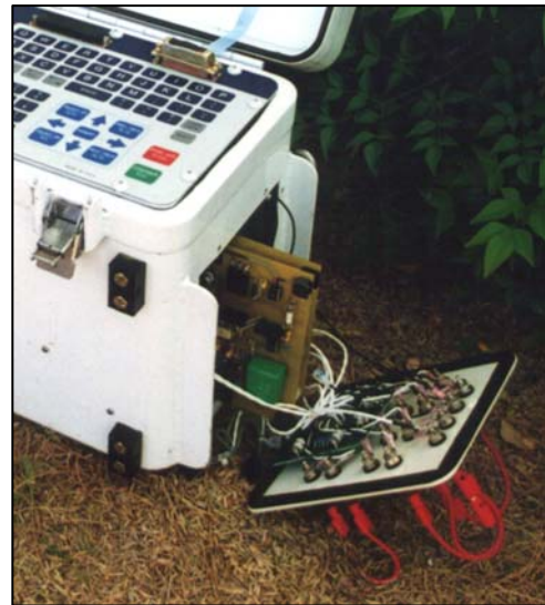
Embedded NanoTEM ® Transmitter

Waterproof case with sealed front panel and connectors Case size: 22 x 28 x 18 cm (8.7 x 11 x 7.1") Weight: 5 Kg (11lb) (without batteries)